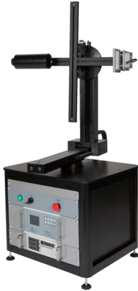
Fig. 2. SSL BPC-Holder_G900. The burning position corrector setup in case of SSL G-900R goniometer.

The burning position effect can be quantified afterwards for the earlier measured luminous intensity data.